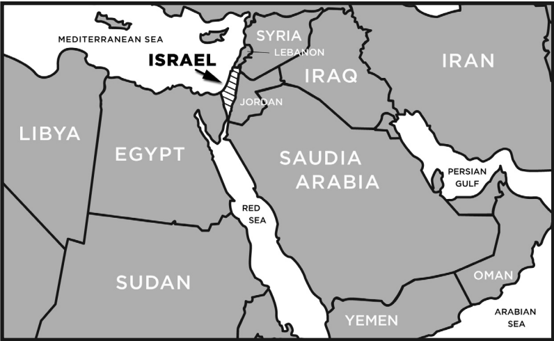
Israel stands alone in the Middle East offering a democratic government, our shared Judeo-Christian values, and religious freedom for Jews, Christians, and Muslims alike.

We believe Israel’s ancient prophets who warned of dire consequences to any nation who would divide your land. [See Joel 3:1-2]