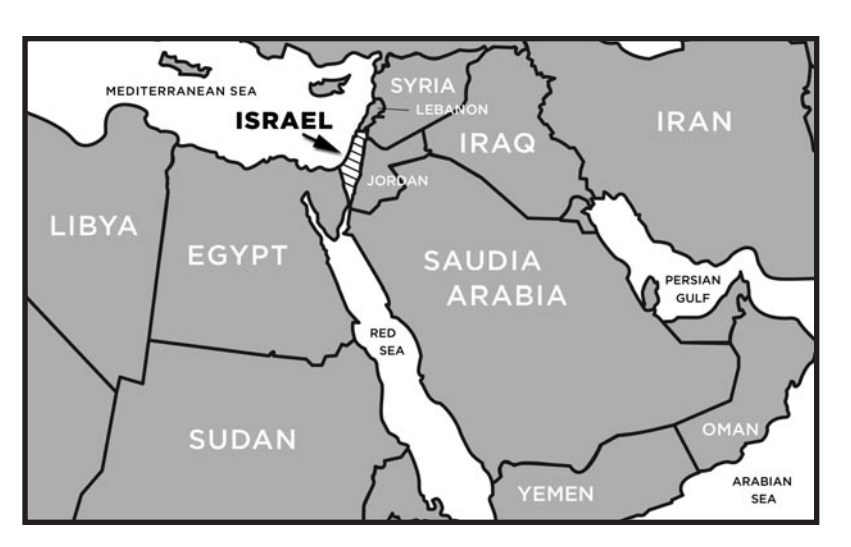
Israel stands alone in the Middle East offering a democratic government, our shared

We acknowledge Jerusalem as Israel's God-ordained undivided Capital, knowing that Israel's sovereignty will protect the holy sites of all faiths, rather than allowing them to come under control of Hamas terrorists who hate Jews and Christians alike.